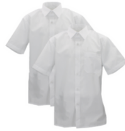
White Shirt (Long or Short Sleeved)