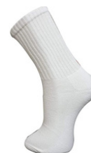
White Sports Socks