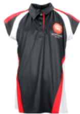
Downsend Polo (Cricket and PE)