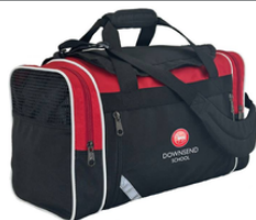
Sports Bag Embroidered with either initial and surname or surname only