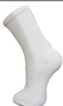
White Sports Socks