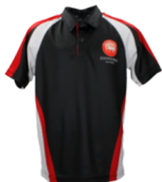
PE and Cricket Polo Y7 - 11