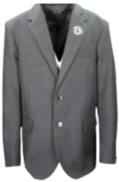
Downsend Grey Blazer To be worn at all times