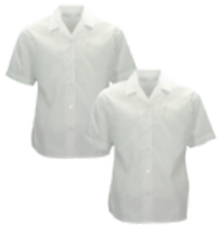
White open-neck blouse (long or short sleeved)