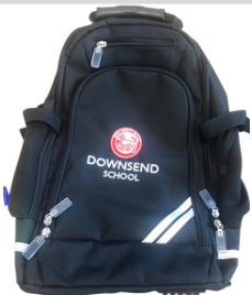
Large Black Rucksack†