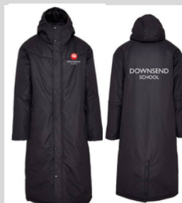
Bench Coat Only for Sport Optional Initials