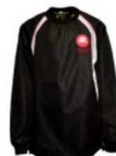
Contact Top (Football and Rugby) Y7-11