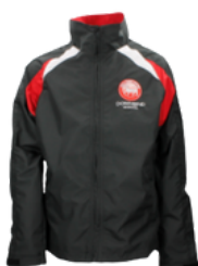
Water-resistant top (Hockey and Netball) †