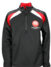
Tracksuit Top (Midlayer)

Girls may choose either Skort or Shorts for Hockey, Netball, Cricket, Athletics and PE