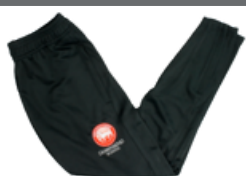
Tracksuit bottoms (Tapered or straight leg) Y7-11