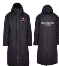
Bench Coat† Only for Sport Optional Initials