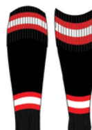
Football Leg Sleeve Y9-11