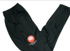
Tracksuit bottoms (Tapered or straight leg) †