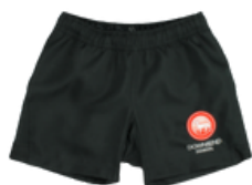
Rugby / PE Shorts Y7-11