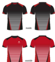
Reversible Football Top Y9-11