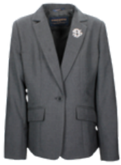
Downsend Grey Blazer