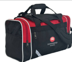
Sports Bag Embroidered with either initial and surname or surname only