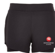
2 in 1 Shorts

Girls may choose either Skort or Shorts for Hockey, Netball, Cricket, Athletics and PE