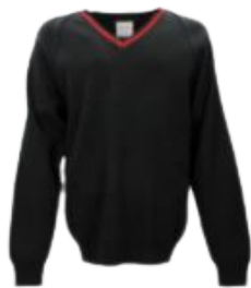
Downsend Black Jumper with Red Trim