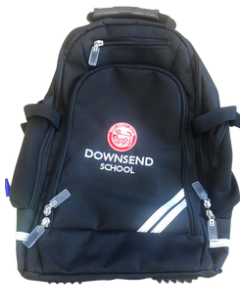
Large Black School Bag/Rucksack†