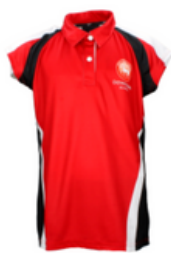
Games Top (Hockey and Netball)