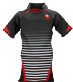
Reversible Games Top Rugby Y7-11